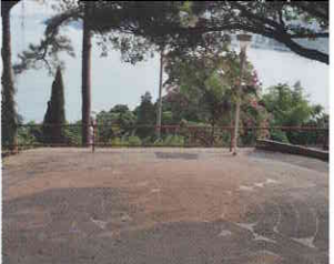
明陣花園 Labyrinth Garden