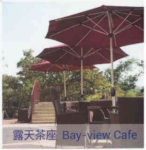
露天茶座 Bay-view Cafe

* 飯堂提供免費WiFi網絡。 Free WiFi is provided in the canteen.