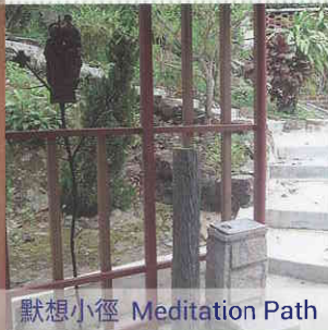
默想小徑 Meditation Path