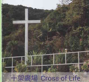
十架廣場 Cross of Life