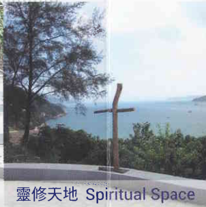
靈修天地 Spiritual Space