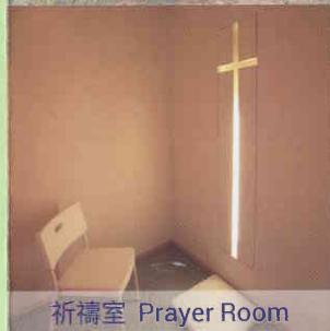
祈禱室 Prayer Room