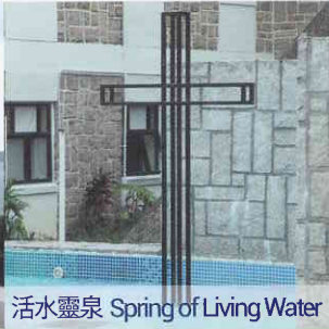
活水靈泉 Spring of Living Water